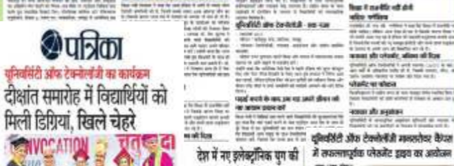
यूनिवर्सिटी ऑफ टेक्नोलॉजी की कार्यक्रमावली दीक्षांत समारोह में विद्यार्थियों को मिली डिग्रियां, खिले चेहरे।