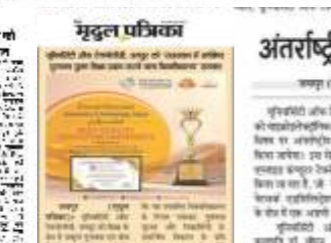
यूनिवर्सिटी ऑफ टेक्नोलॉजी में गाम्भीर्य से आयोजित कार्यक्रम का आयोजन किया गया।