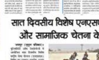
यूनिवर्सिटी ऑफ टेक्नोलॉजी के दैनिक नवज्योति पत्रिका का प्रकाशन किया गया।