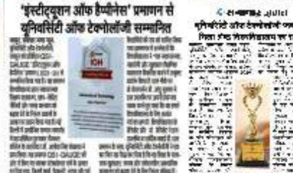
यूनिवर्सिटी ऑफ टेक्नोलॉजी में निर्यात शिक्षा का कार्यक्रम आयोजित किया गया।