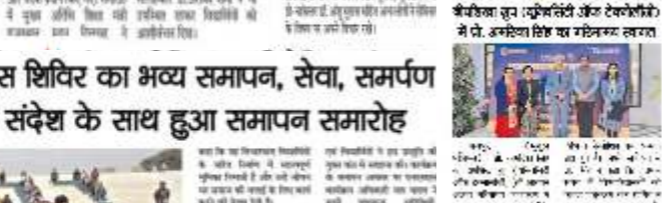
यूनिवर्सिटी ऑफ टेक्नोलॉजी का सात दिवसीय विशेष एनएसएस शिविर का समापन समारोह आयोजित किया गया।