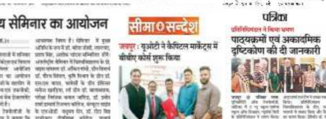
यूनिवर्सिटी ऑफ टेक्नोलॉजी में अंतर्राष्ट्रीय सेमिनार का आयोजन किया गया।