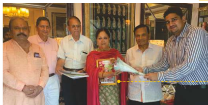
Smt. Vasundhara Raje Ji Former Chief Minister Rajasthan