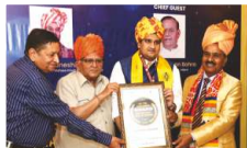
Shri Madan Dilawar Ji Hon'ble Minister of Cabinet for School Education, Panchayati Raj & Sanskrit Education Rajasthan