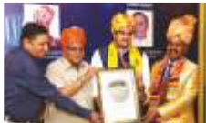
Shri Madan Dilawar Ji Hon'ble Minister of Cabinet Education, Panchayati Raj & Sanskrit Education Rajasthan