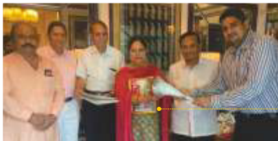
Smt. Vasundhara Raje Ji Former Chief Minister Rajasthan