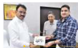
Shri Prem Chand Bairwa Ji Hon'ble Deputy Chief Minister of Rajasthan Minister for Higher and Technical Education of Rajasthan