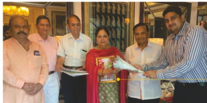
Smt. Vasundhara Raje Ji Former Chief Minister Rajasthan